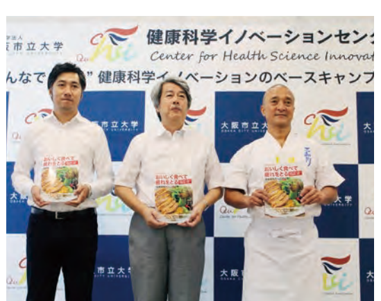
The study results published as an anti-fatigue recipe book

A research group of Director Yasuyoshi Watanabe of the Center for Health Science Innovation conducted a study elucidating the improvement of stress and brain function through intake of Japanese food*1 to scientifically demonstrate why Japanese food is good for health and successfully demonstrated the anti-fatigue effect of Japanese food in terms of subjective fatigue and autonomic nerve functions.